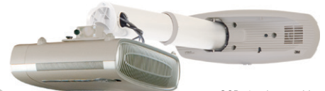
SCP717 shown with optional folding wall mount